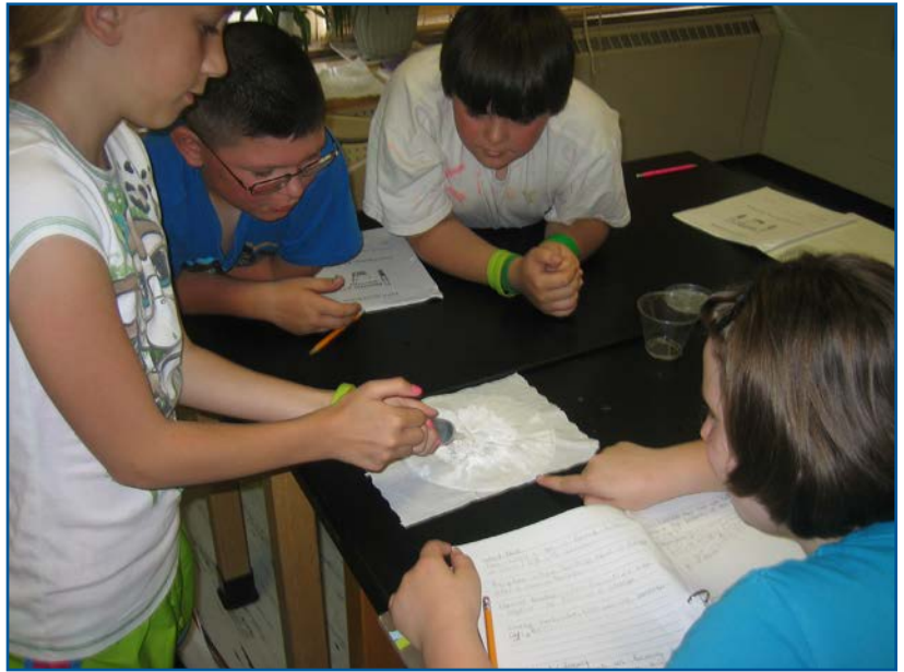
Fifth graders at Tuscarora Elementary experiment with Mixtures and Solutions.

Addison students use engineering and science skills to build remotely operated vehicles (ROVs).