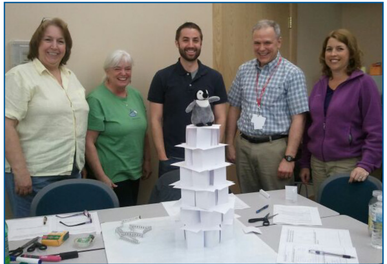
Teachers learned the engineering process first-hand in an Engineering is Elementary training.

The GST BOCES STEM Team is working to support and prepare teachers for the possible adoption of the Next Generation Science Standards (NGSS) that were released in April. Since the NGSS are based on the Framework for K-12 Science Education developed by the National Research Council, scientific and engineering practices have a central role in what teachers should be considering in their instruction. The GST STEM ISC Team is integrating the new NGSS framework into the regional monthly trainings we provide for teachers in grades K-12 with a focus on identifying and making sense of the scientific and engineering practices.