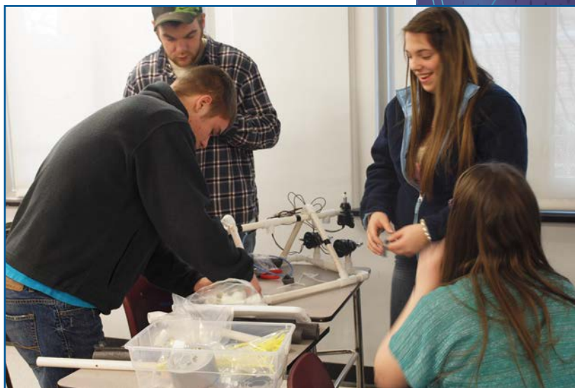
Addison students use teamwork to build remotely operated vehicles (ROVs).