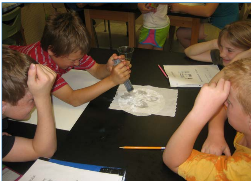
Fifth graders at Tuscarora Elementary have fun working with Mixtures and Solutions.